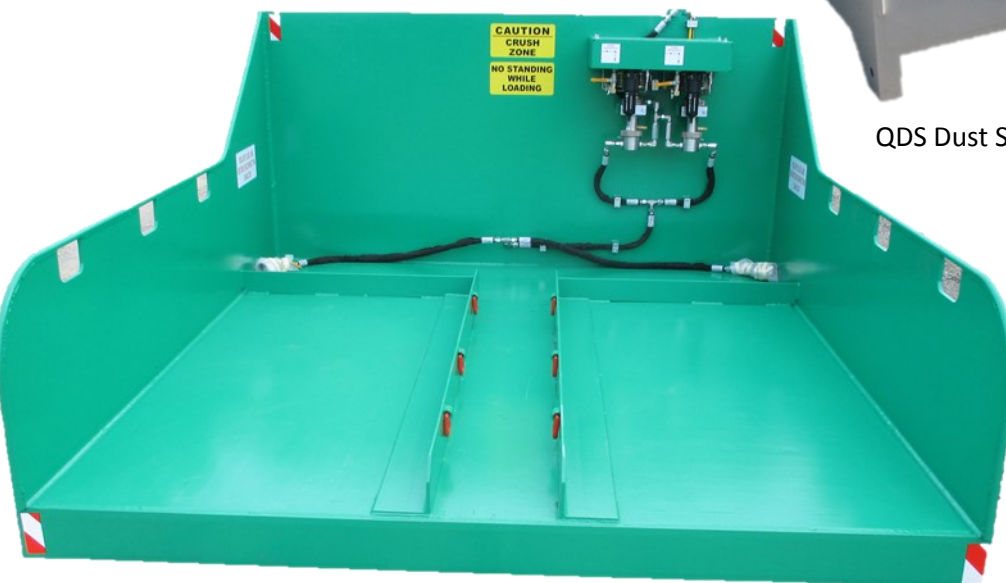
QDS Dust Suppression Pod

NMQ Engineering Pty Ltd Trading as CHJ Engineering