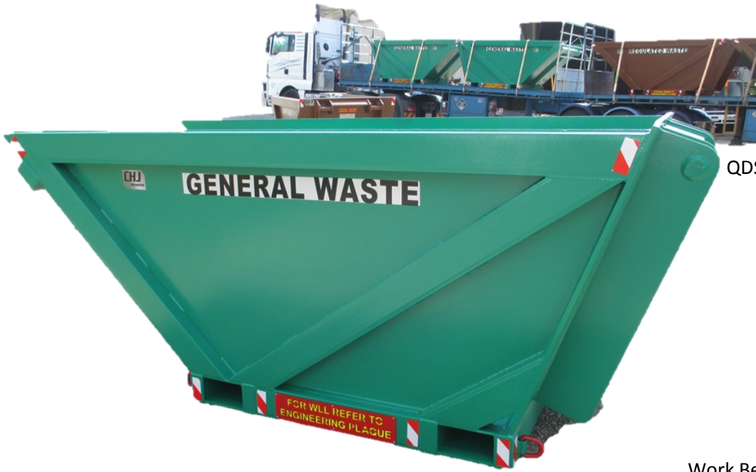
QDS Dump Bin