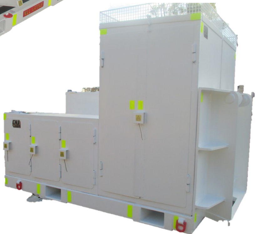
QDS Trade Pod