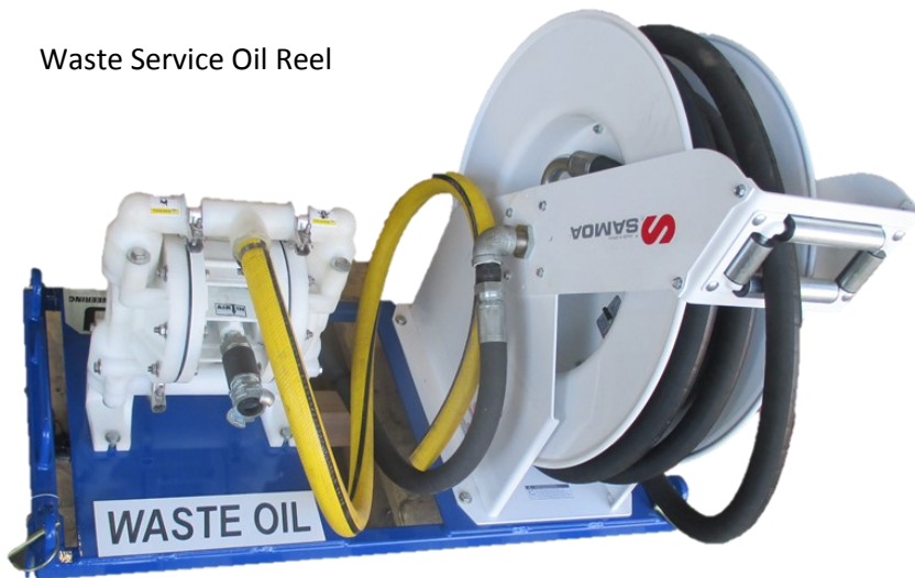
Waste Service Oil Reel